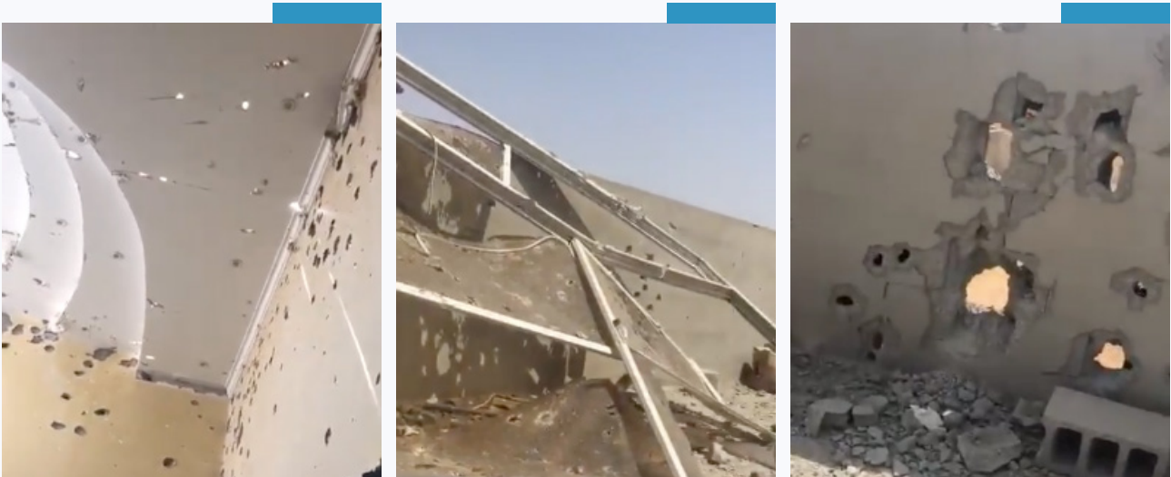
Al-Huwaiti’s home following the raid.

Early the following morning, on 13 April 2020, dozens of Special Forces surrounded his house, accompanied by several armoured trucks. According to witnesses, at 5:40 am the Special Forces attacked al-Huwaiti’s house with heavy weapons, without warning or provocation. Al-Huwaiti returned fire, briefly, before he was killed. Video footage of the house shows that the Saudi security forces used excessive force and live ammunition whilst raiding the property.