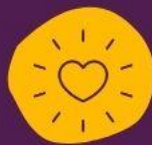
Producción para el Bienestar