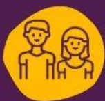
Programa Jóvenes Escribiendo el Futuro

Entre 2021 y 2022, el #Anexo13 incrementó un 81.05%, sin embargo los recursos se destinaron a programas SIN reglas claras ni perspectiva de Género: