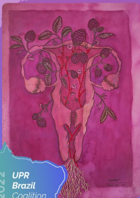
Art: As mais cuidadosas amor • Artist: Eliene Eze